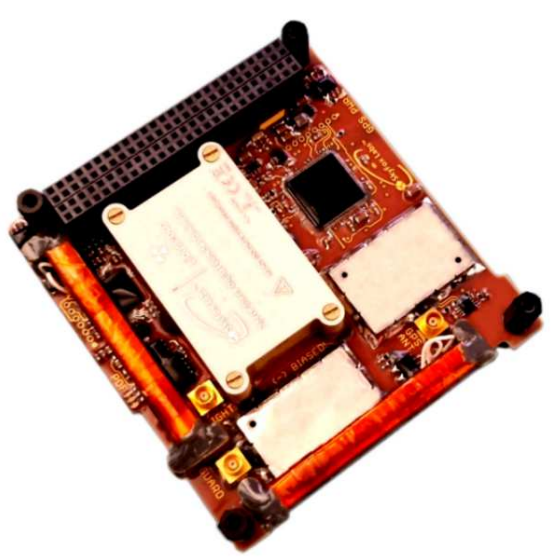
Fig. 1 PC/104+ CubeSat Space Weather Monitor, Flight Model, Top side view.